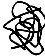
Drawings and scribbles

The earliest writing of very young children includes drawings and scribbles that carry meaning only for them (Whitehurst & Lonigan, 1998). For example, when referring to the scribble below, a child might explain, "This is about my cat."